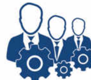
Business & Operation