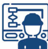
Engineering & Design