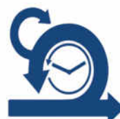
Agile & SCRUM