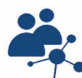
HR Capacity Building