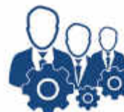
Business & Operation