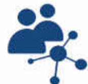
HR Capacity Building